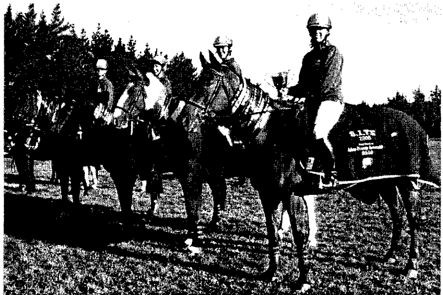
Nelson WOW the winners!